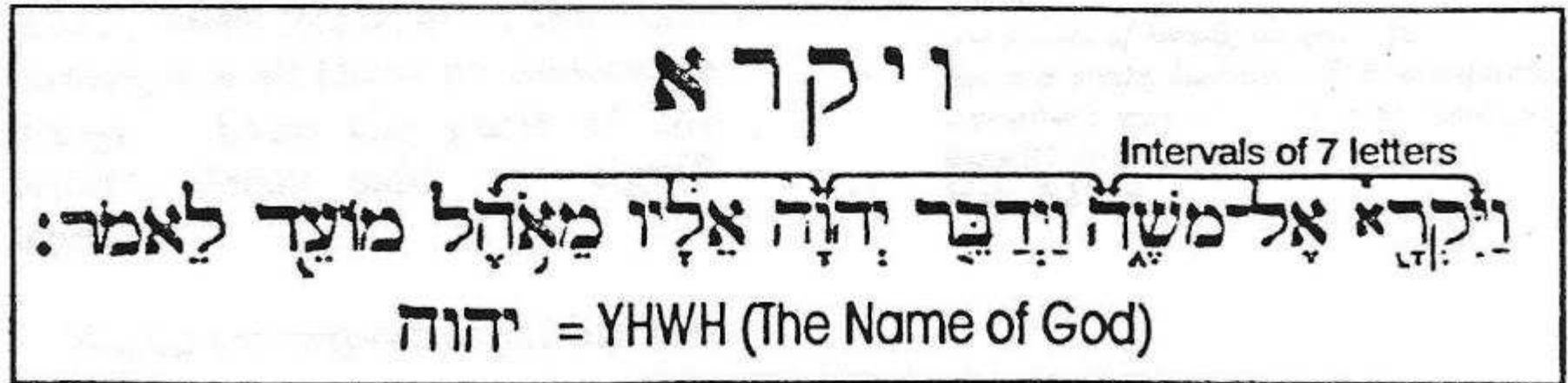
Figure 3. Example from the Book of Leviticus